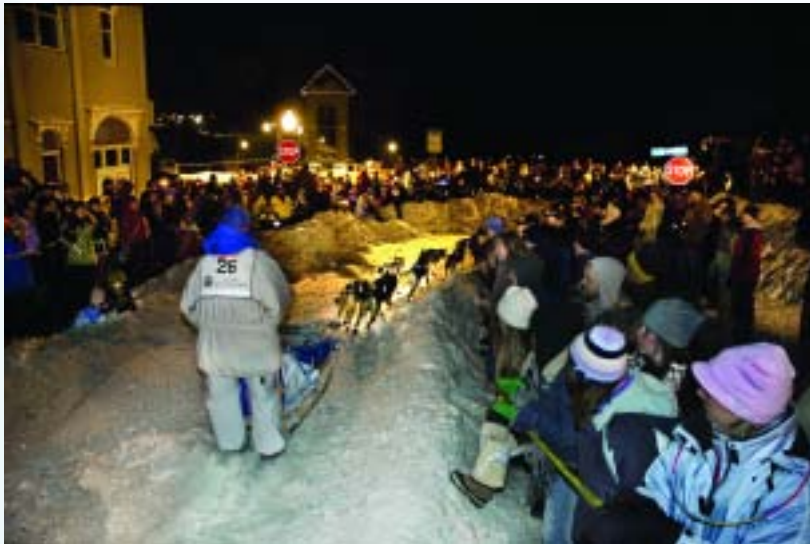
Andy Gregg, MQT Photo

T he U.P. 200 Sled Dog Race will reach its 20th anniversary milestone in February. Thousands of visitors will descend upon Marquette and join with local residents to line downtown Washington Street for the start of this Iditarod qualifier. They will cheer as each 12-dog tandem—with musher and sled in tow—eagerly lurches from the chute and begins carving through the snow with rhythmic precision before disappearing down the darkened trail. For spectators, the race is poetry in motion. For organizers, it is a smooth operation, thanks in large part to the work of 1,000 volunteers. Many are NMU students or employees.