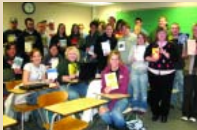
Good Books for Teaching Family Homes