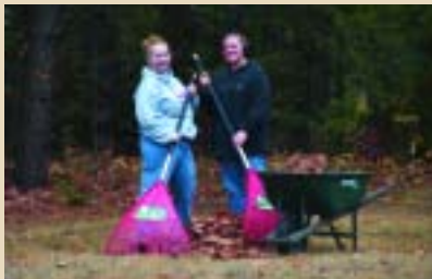
Make a Difference Day

“Service-related activity is being embraced at NMU and is rapidly becoming a distinguishing feature of this university for some very good reasons,” says Bonsall. “We have a very genuine student body with a strong service