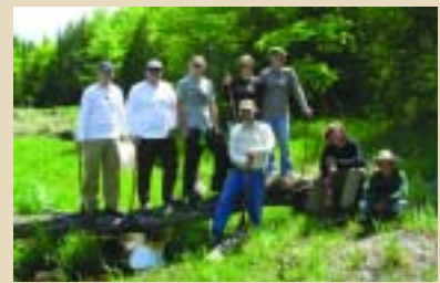
Stream restoration partnership

One of the biggest activities the center coordinates is the annual Make a Difference Day. Last year more than 90 student organizations and 900 students participated, doing painting and yard work for elderly or disabled residents. The center hopes to implement a spring edition of Make a Difference Day in April.