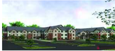
Architectural rendering of the Wright Street student apartment complex at Northern Michigan University.

The students are currently acting as sub-contractors for the new Wright Street student apartments. They are in charge of developing the construction schedule and timeline, and have been using the Jacobetti Center to construct the walls of the building, which will be transferred to the site as needed. CN156 also assisted in the renovation of Magers Hall last year. They did project scheduling, worked closely with planning and development, and attended construction progress meetings. The students' success during the Magers Hall renovation inspired the construction management program to open up other projects for them.