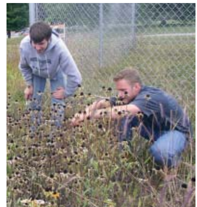
Students are already beginning to collect some seeds from the on-campus site. Here, students are collecting seeds from a large patch of black-eyed Susans.