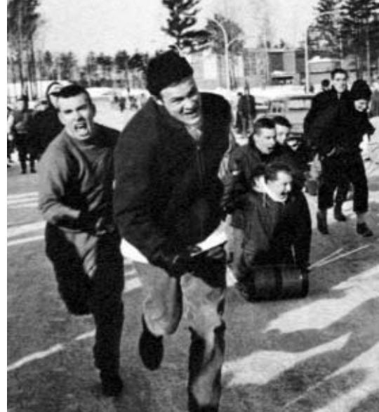
Winter Festival, 1963.