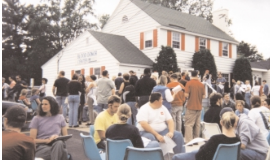
NMU students, faculty, and staff joined Marquette area community members in donating blood at the U.P. Regional Blood Center at Marquette General Hospital following the terrorist attacks.

The NMU community responded in a number of ways to the Sept. 11 terrorist attacks against the United States. The university canceled classes effective at 1 p.m. the day of the tragedies. Many students, faculty, and staff stood in line for more than two hours to donate blood at the U.P. Regional Blood Center at Marquette General Hospital. That same evening, the university hosted seven informal gatherings across campus to discuss the day's events. Each was staffed by representatives from student services, the counseling center, and campus ministries.