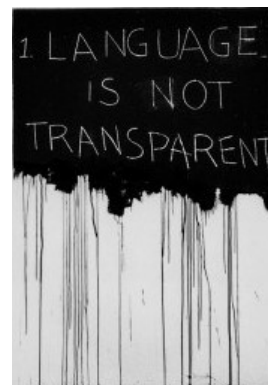
Mel Bochner, Language is Not Transparent, chalk on paint on wall (1970)